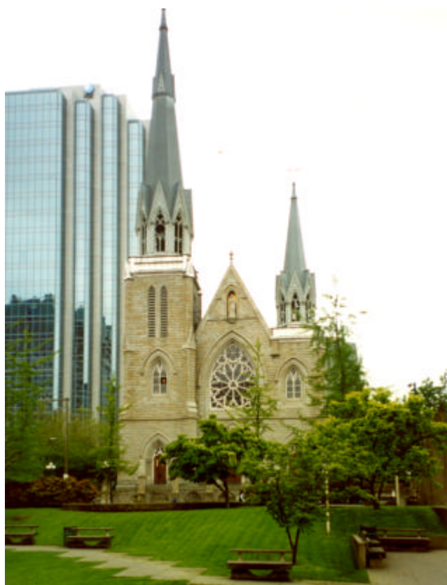
Holy Rosary Cathedral, Vancouver, which this year joined the list of leading Society Towers.