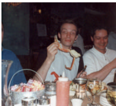
(L) The Master strikes up a beautiful (but short lived) friendship with a crab in Toronto.

AND FINALLY.....two fishy memories of Canada 2000