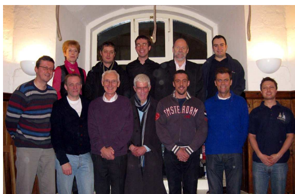
The first ASCY peal on 12 bells at St Magnus the Martyr.