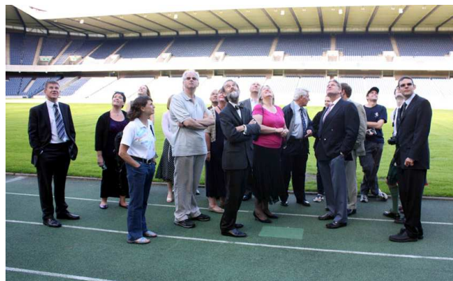
A tour of Murrayfield Stadium prior to the Dinner.