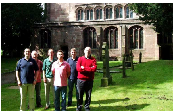
The first peal on the augmented ring of 6 at Brereton.