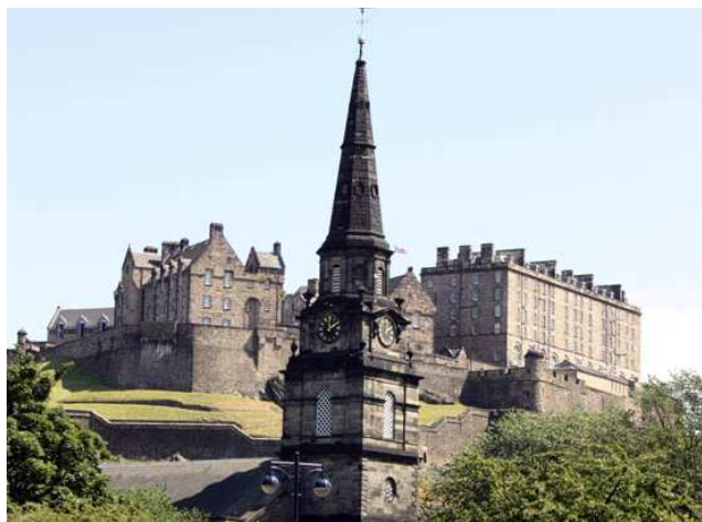
St Cuthbert, Edinburgh - host to the Country Meeting.

One of the highlights of 2009 was undoubtedly the National 12-Bell Contest at St Paul's Cathedral in June. A happy throng of nearly 500 people mingled in Paternoster Square to listen to a feast of high-class ringing on those majestic bells. The Society's band exceeded expectations in finishing a very close third, giving the home team (who just pipped the Birmingham band) a strong run for their money. Congratulations to the St Paul's Guild on a famous victory and for putting on such a superb event.